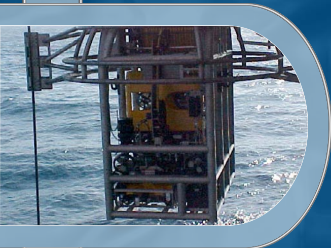
Simultaneous deployment of Magnum and Minimum ROV systems.