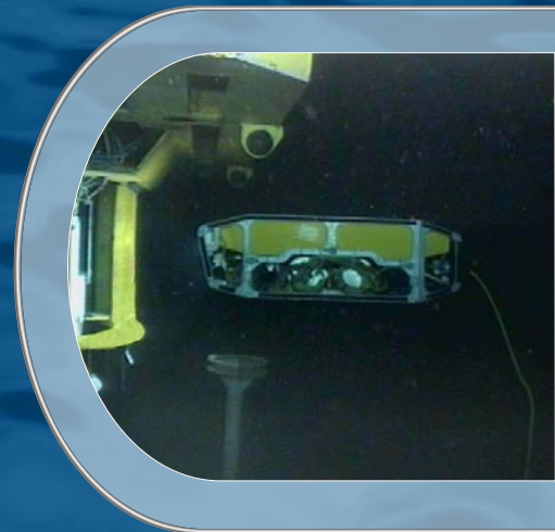
The Minimum ROV supporting drilling operations at 9,347 fsw.