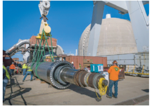
Preparations for Unit 3 generator rotor offsite transportation