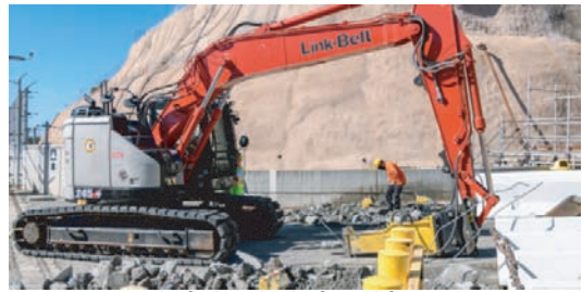
Removal of Alimak platform lifts on Unit 3 Containment Dome