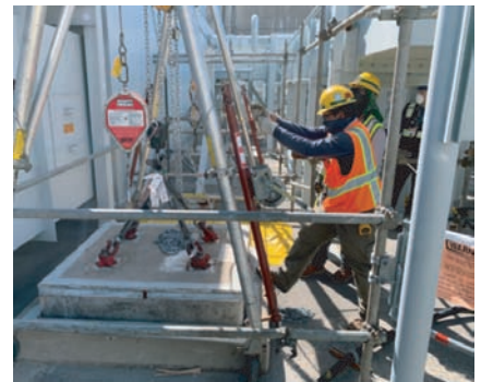
Floor plug removal work in the Radwaste Building