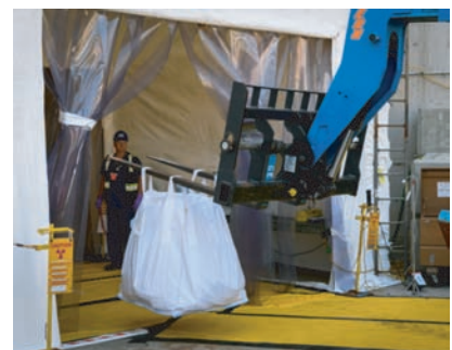
Asbestos removal work in U2 & U3 Containment