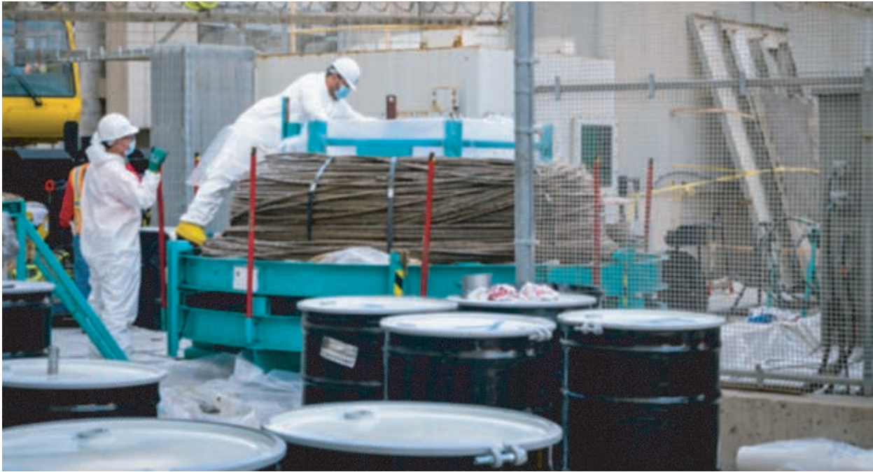
Containment Dome tendon removal