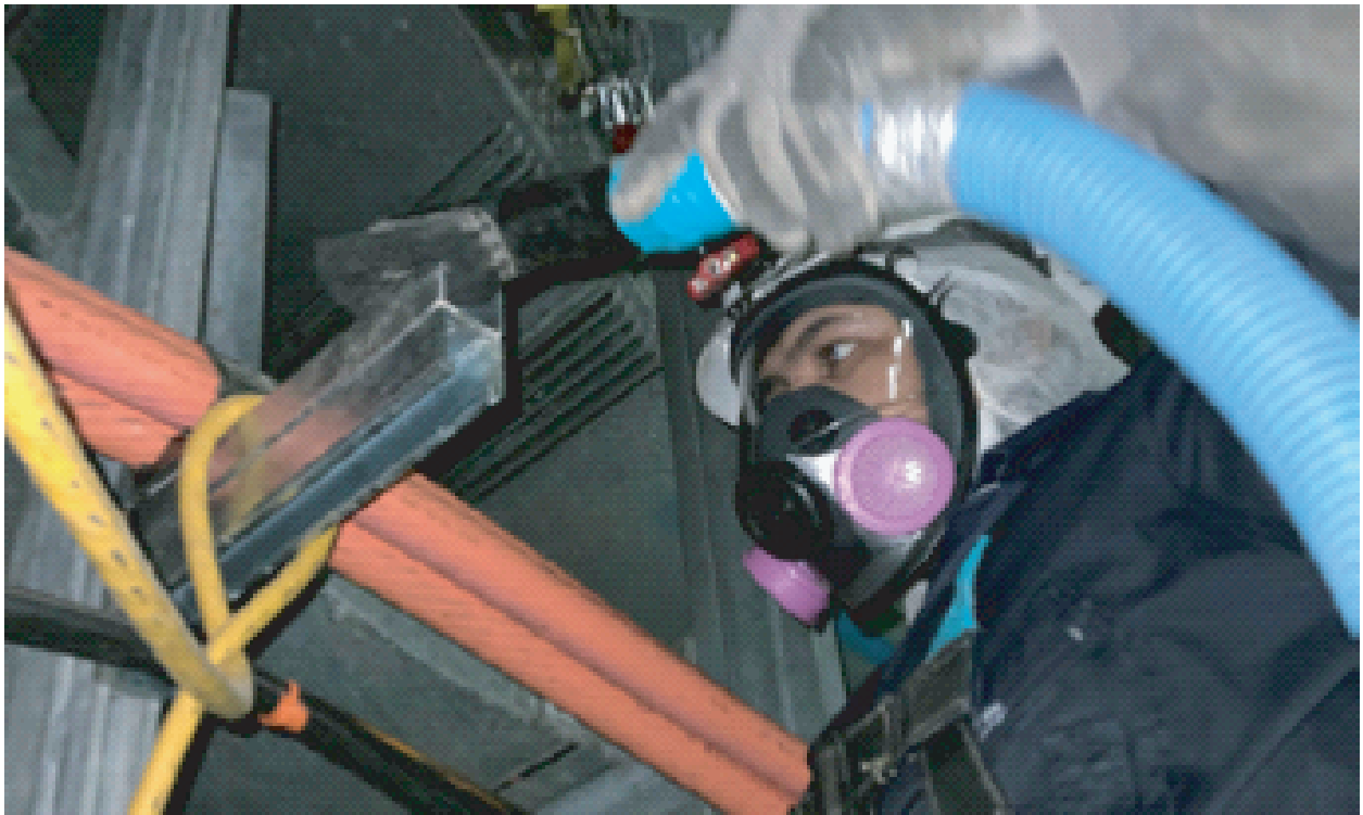
Removal of friable asbestos containing material (ACM)