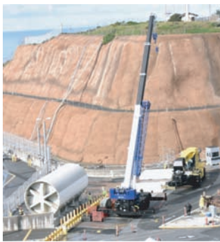
Preparation for RPV1 transportation