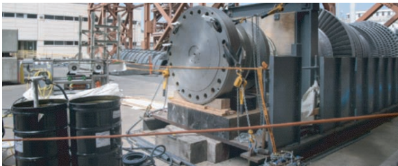
Diamond saw testing within the Unit 2 Crane Bay