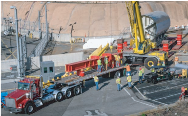
Preparation for RPV1 transportation