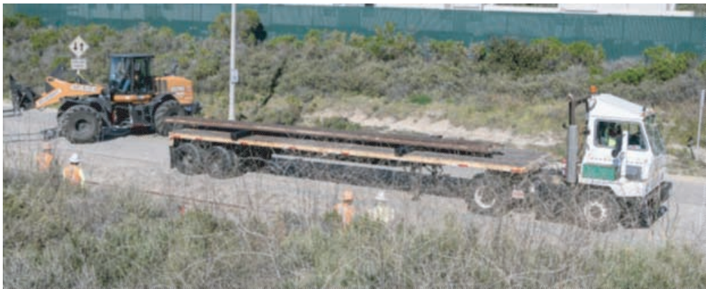
Rail spur upgrade work