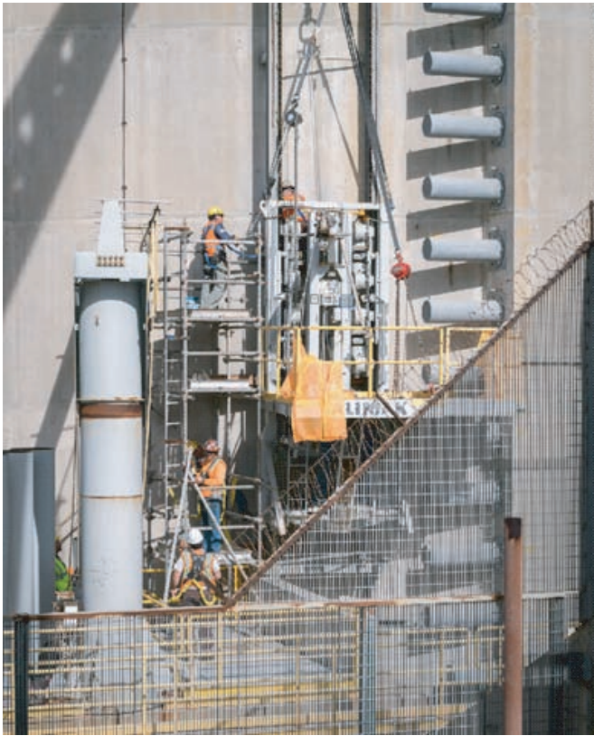
Removal of North Industrial Area north swing gate