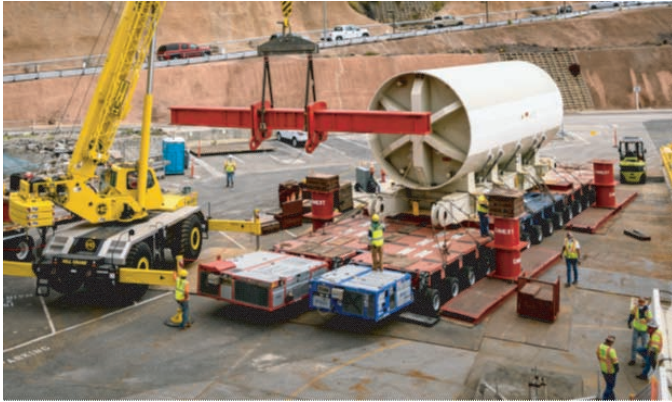
Preparation for RPV1 transportation