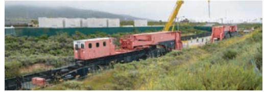
Preparation for RPV1 transportation