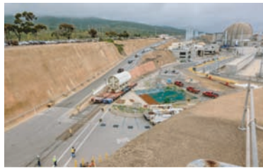
RPV1 move to rail spur for offsite transport