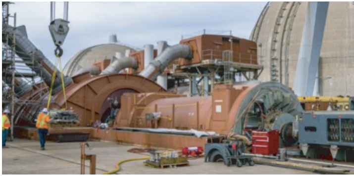
Preparations for Unit 3 generator rotor offsite transportation