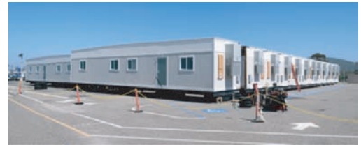
Employee trailer assembly