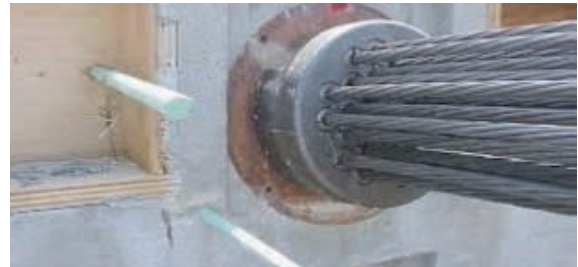
Containment Dome tendon removal preparations