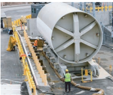
Preparation activities for RPV1 transport