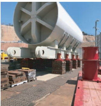
Preparation for RPV1 transportation