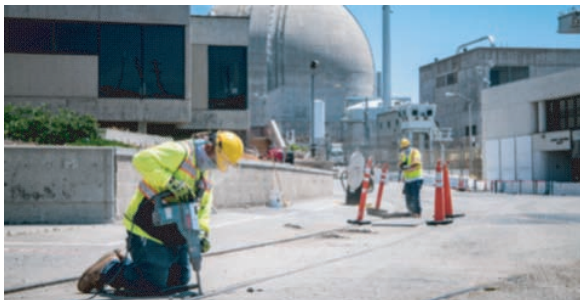
Rail line upgrades