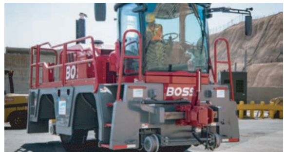
Rail line upgrades