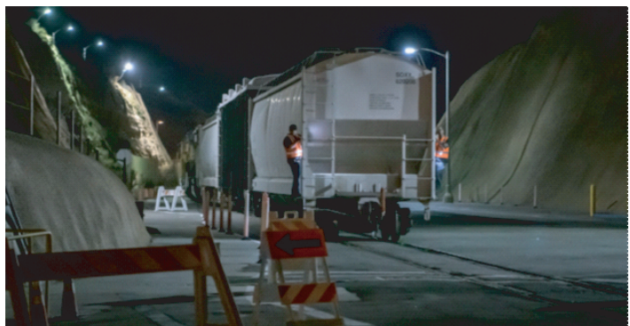
Rail shipment to Utah