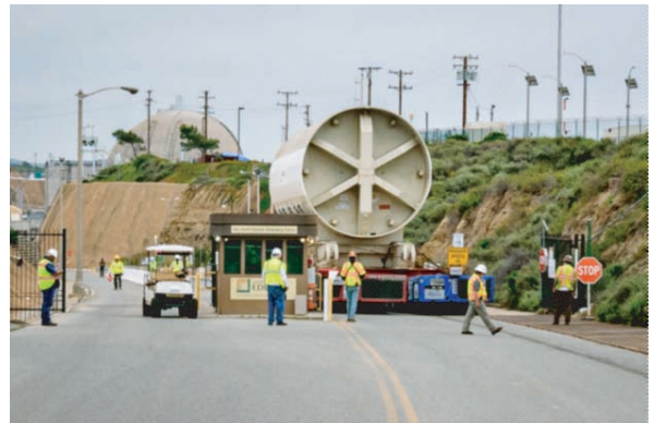
RPV1 move to rail spur for offsite transport