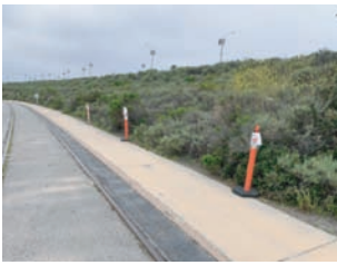
Nesting bird protective measures