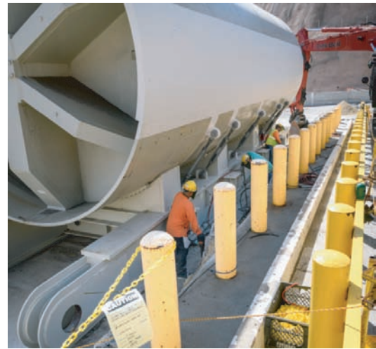
Preparation activities for RPV1 transport