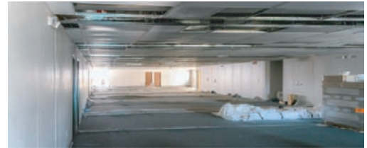
Employee trailer assembly