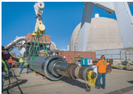
Preparation of Unit 3 generator rotor offsite transportation