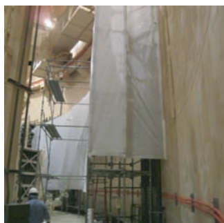
Asbestos removal work in U2 & U3 Containment