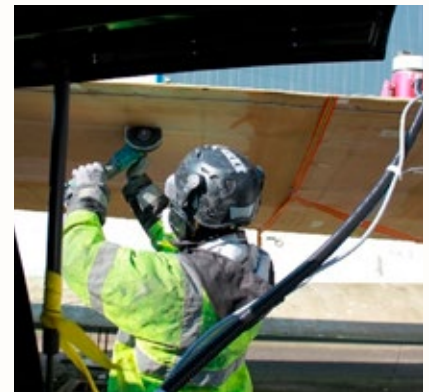
Damage detection sensor tests

Eleven-I (UK) and Innvotek (UK) are working with GE Renewable Energy and ORE Catapult on robotic solutions as part of the 'Stay Ashore' R&D programme and delivered through the Offshore Wind Innovation Hub's Innovation Exchange (OWiX) in partnership with KTN. Both companies receive technical support, guidance, and demonstration opportunities