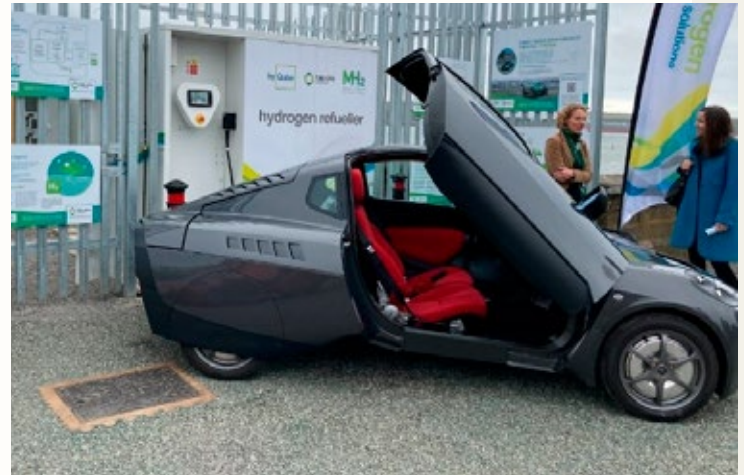
Riversimple RASA hydrogen fuel cell electric car

as remotely operated vehicles, digital twins, cable arrays, and sensors. They now demonstrate their technologies to major stakeholders such as Equinor and EDF Renewables.