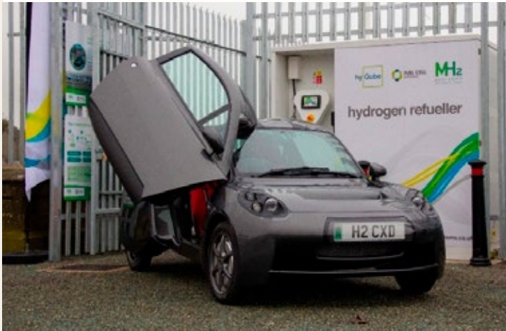
Riversimple RASA hydrogen fuel cell electric car