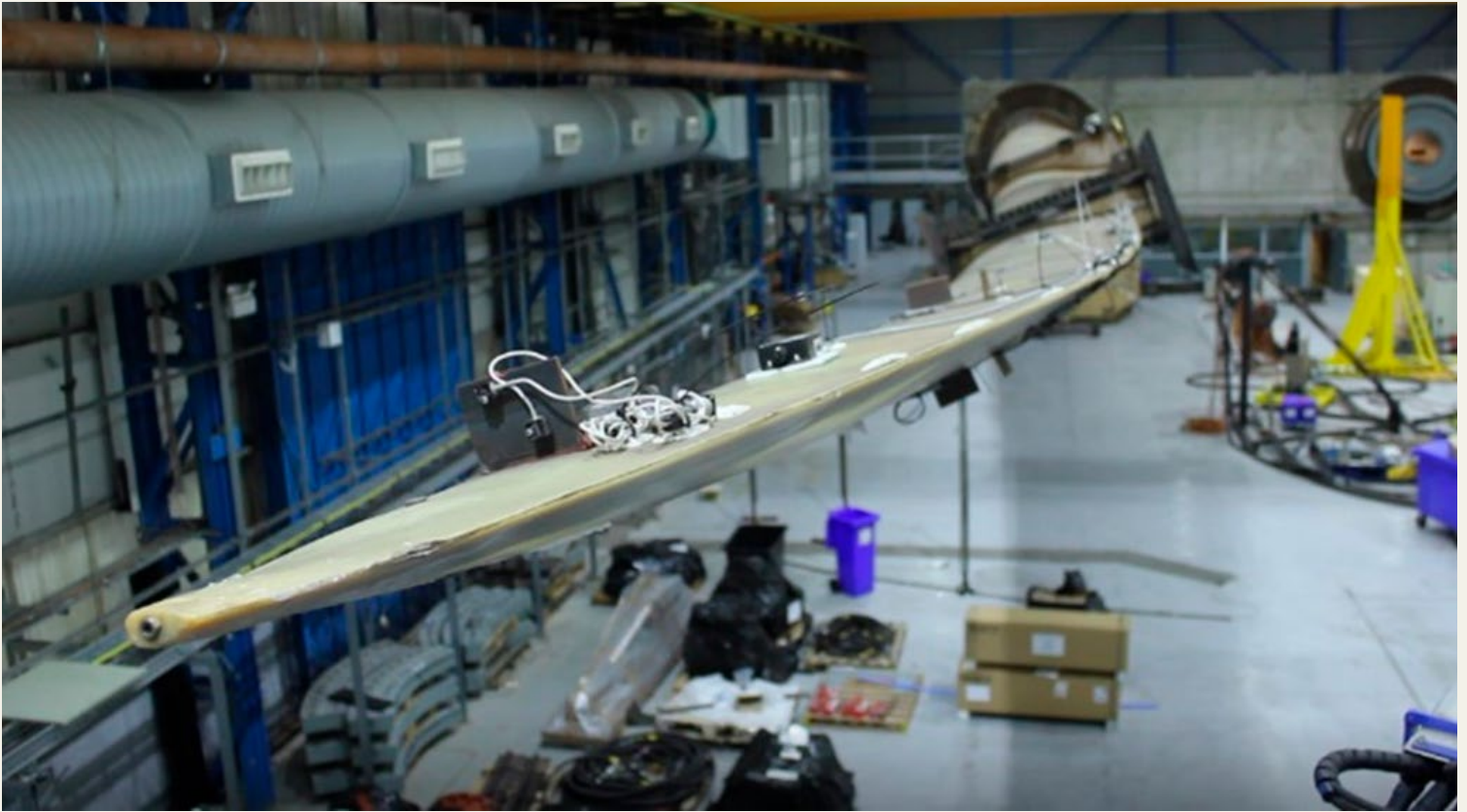
Root mounted sensor tests.