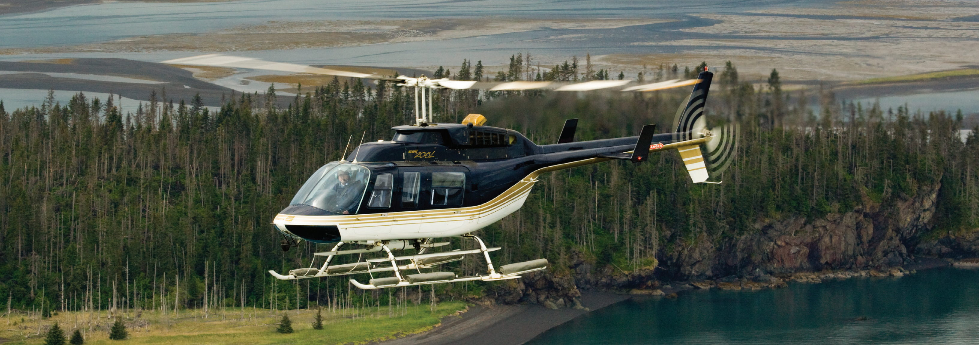
BELL 206L4 | A reliable multi-mission capable helicopter with low operating costs.