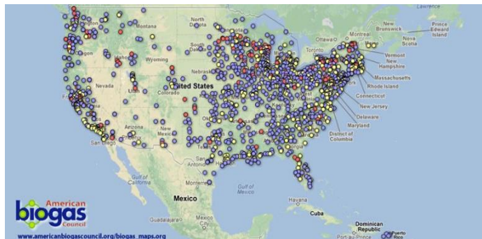
Figure 2: Operational biogas systems in the continental United States 7

The United States currently has 2,200 operating biogas systems across all 50 states, and has the potential to add over 13,500 new systems. 8