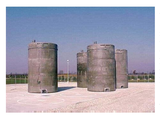
Dry Cask Storage of Spent Fuel

All U.S. nuclear power plants store spent nuclear fuel in "spent fuel pools." These pools are made of reinforced concrete several feet thick, with steel liners. The water is typically about 40 feet deep and serves both to shield the radiation and cool the rods.