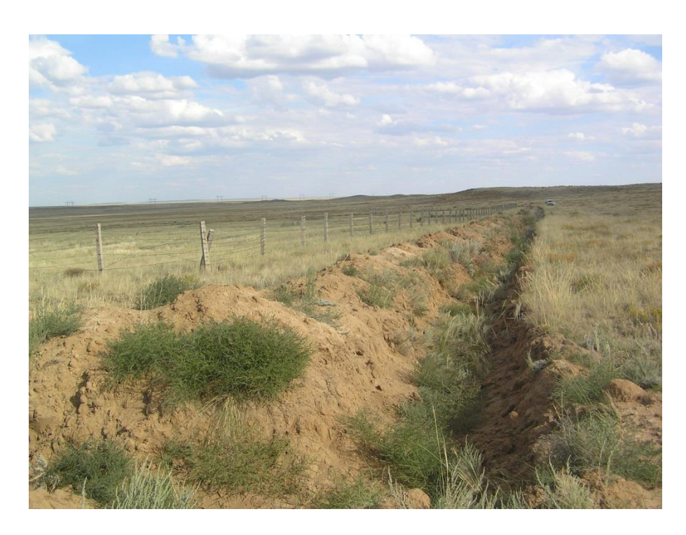
Example of trench/physical barrier