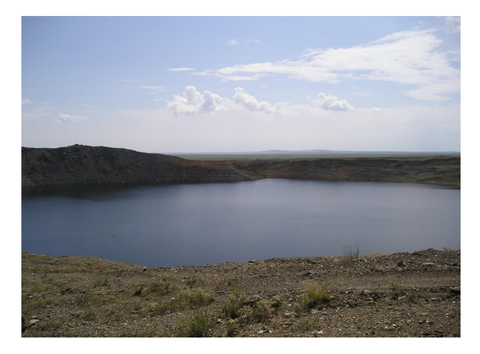
'Atomic Lake' – intentionally created by a nuclear detonation in 1965