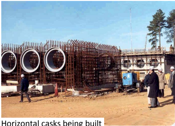
Horizontal casks being built

The NRC developed cask licensing requirements through a public process to provide a sound basis for ensuring protection of public health and safety and the environment. NRC staff conducts thorough reviews and only approves designs that meet those requirements. Utilities can choose from two licensing options, which both allow for public input: