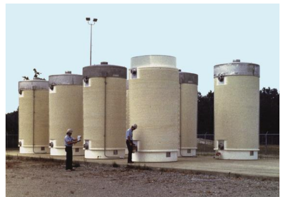
Vertical casks being monitored

Additional information is available at http://www.nrc.gov/waste/spent-fuel-storage/faqs.html .